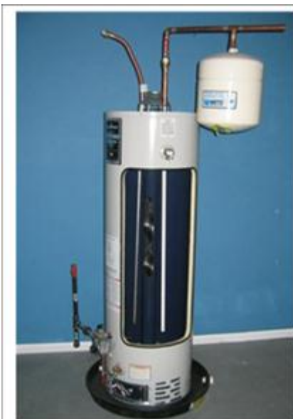
Water heater with thermal expansion tank installed.

A full copy of the proposed budget is available on the District website, www.hpwatersewer.com . The budget will be adopted at the November 8 regular meeting of the Board of Commissioners.