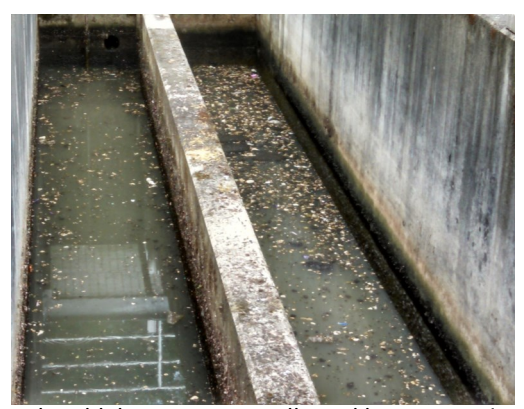
The old, larger screens allowed large quantities of refuse to enter the plant.

The project, spanning over three years, came to a total price tag of $240,000, including almost $80,000 in engineering costs.