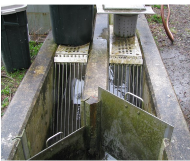
Old headworks screens

new requirements set by the State Department of Ecology. After wastewater is collected via the sewer system, the raw wastewater enters the treatment plant headworks, where screens trap large solids before the wastewater enters the settling basins. The new regulations required a smaller screen size of 3/8 inch. This smaller