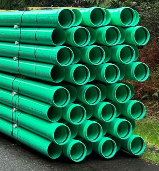
New service lines staged prior to installation