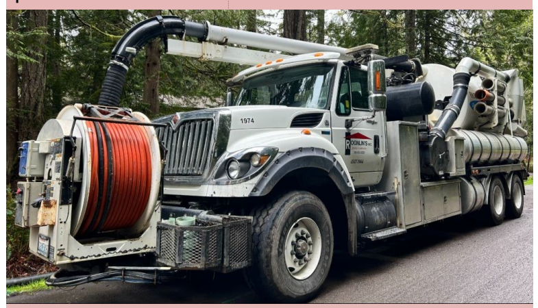
Heavy equipment used to rehabilitate service lines